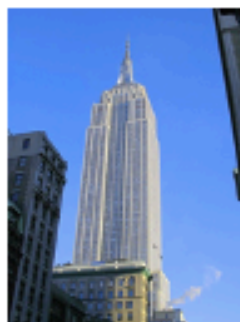
Empire State Building