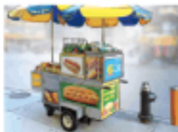
5. hot dog cart