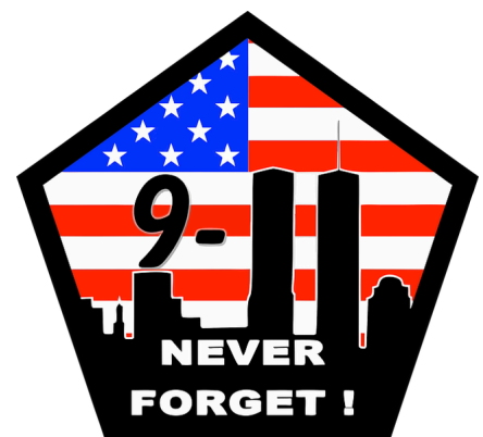
zwillinge, new york, twin towers

③ Open your workbook page 2. Do the exercises 1 and 2 from page 2 and the exercises 1 and 2 from page 3.