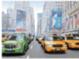
1. traffic jam