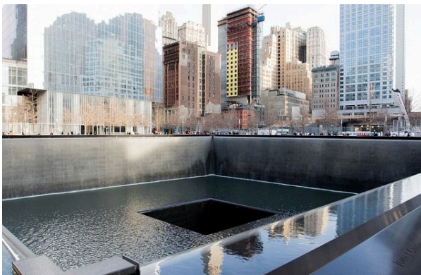
denkmal, nyc, new york

file:///Users/isabelle grigorieff/Downloads /547944 CD1 Tr01% 20(2).mp3