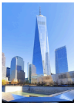
One World Trade Center