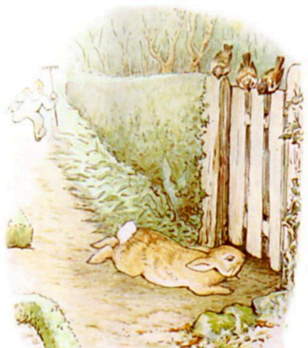
Peter saw the gate, ran very fast and slipped underneath it.