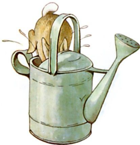
Peter jumped into a can.