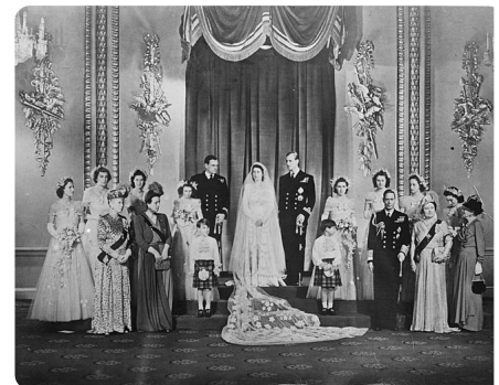
The wedding of Queen Elizabeth and her husband Philip, 1947