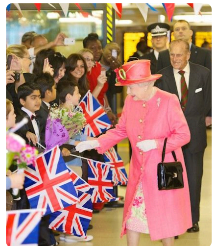
Visiting Birmingham, 2012