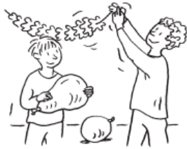
decorate the party room