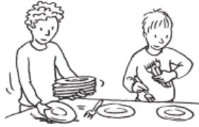
lay the table