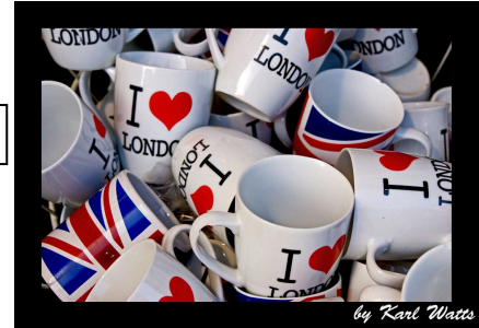
I Love London Mugs