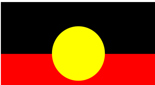
the colours of the Aboriginal flag

--> Exercise 2a) on page 14. Use the dictionary part of your book for help. and then do ex. 6 in the WB p.6