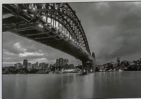
Sydney Harbour Bridge

F Working two jobs at the same time was challenging. But my photos were successful, so one year ago I took the risk and gave up my job at the bank to become a professional photographer. It's definitely not an easy job. I had to learn how to manage my own business. I would advise everybody who's thinking of having his or her own business to do the same thing – it's important. Anyway – today I have my own business and I'm proud of it.